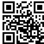
IEI Resource Download Center