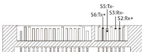
CFast 3SE: Pin Directions

The optional ATA Security Mode feature set is a password system that restricts access to user data stored on a device. The purpose is to prevent unauthorized access or a virus.