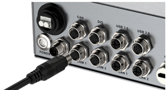
USB / COM / DIO / LAN

Wide-range 10–28V DC input via M12. M12 to Mini-Din 4P Female power cable included for fast cabinet wiring.