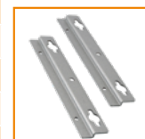
Wall mount bracket