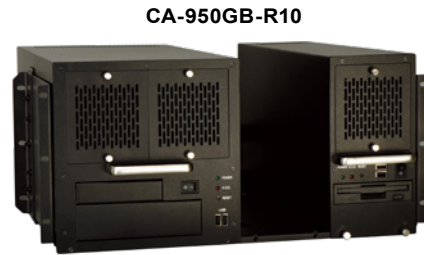
CA-950GB-R10 19" rack carrier can carry four RACK-500AI and fit into standard 19" width rack with 5U height.