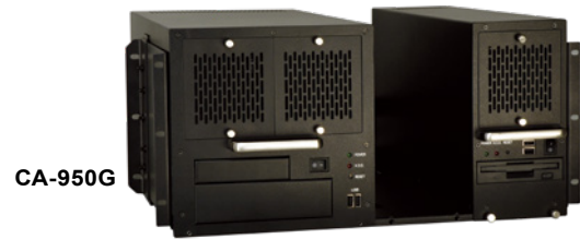
CA-950G 19" rack carrier can carry four RACK-500G and fit into standard 19" width rack with 5U height.