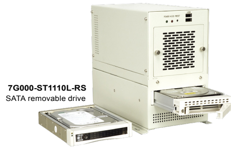
3.5" SATA removable drive bay compatible