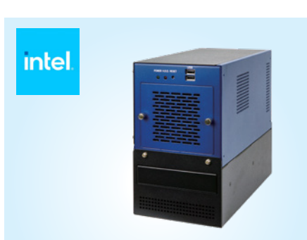
PAC-400AI Intel® SkyLake Al Box PC