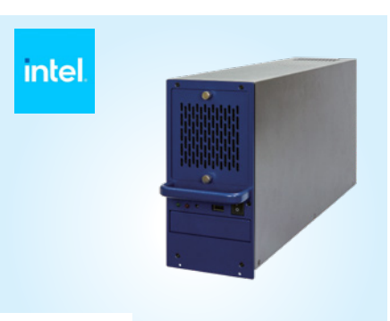
RACK-500AL Intel® Coffee Lake AI Box PC